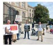
Celebrating and Praising our Lord at Ga Capital after the Dobbs ruling and overturning Roe Vs Wade...Praise God...but the war continues!