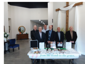
Life presentation at First Baptist Buchanan-Allen Wilburn and the leadership team!