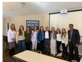
Liberty Baptist Church High School Youth Group: FIRST PLACE VIDEO CONTEST WINNERS FOR THE STATE OF GEORGIA! Building a culture of life for today and the next generation!