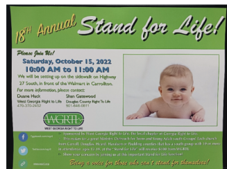
18th Annual WGRTL Stand for Life: Expecting another great crowd this year on Sat Oct 15th in Carrollton