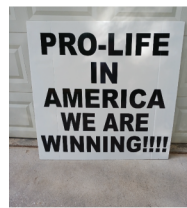
One of our locally produced "Bridges over Life" outreach event signs! Tens of thousands across GA are seeing the message of Life at each event!