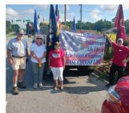
WGRTL and CCGOP Republican Life Float during 4th of July Parade Carrollton