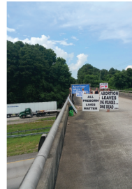
Bridges for Life event in Waco, GA. Great turnout of both young and old "Lifers for Christ"