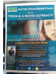
Flyer for "Dinner and a Movie" at Rebekah's Gospel Barn-Carrollton-Powerful Pro-Life Spirit was felt, even an altar call afterwards!