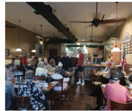
WGRTL presents to the Carroll County Republican Party and the Young Republican group the Message of Life