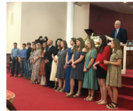
Liberty Baptist Bowdon GA recognizing the Liberty Baptist HS Teen group as Ga state champs in the GRTL oratory contest